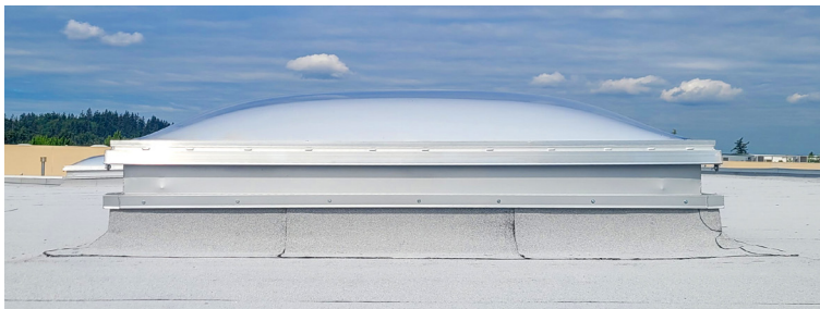
Curb mounted smoke vents installed on existing curb