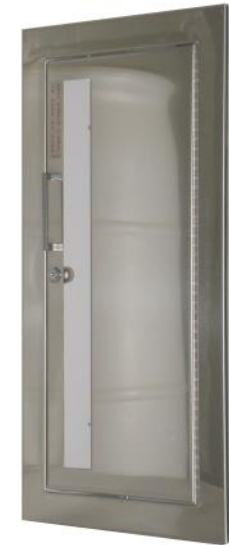
#8 Near Mirror Finish Note Reflected Image of Objects

#4 Finish: Type 304 Stainless—standard on our products. Characterized by short, parallel polishing lines. This is the most common finish. Also described as a number 4 polish.