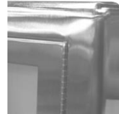
#7 Polished Finish